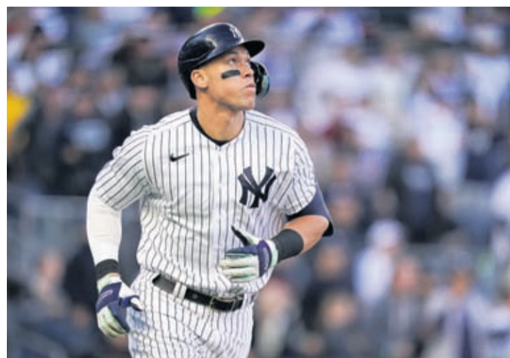
New York Yankees' Aaron Judge watches his solo home run ball during the second inning of Game 5 of an American League Division baseball series against the Cleveland Guardians, Oct. 18, 2022, in New York.